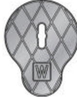
Lid Type J