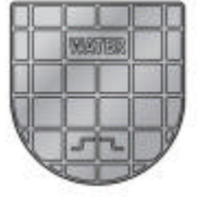
Lid Type F