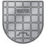
Lid Type F