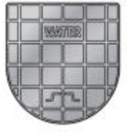
Lid Type F