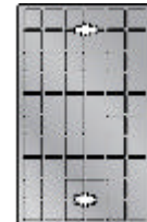
Lid Type L