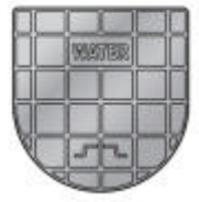
Lid Type F