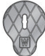
Lid Type J