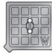
Lid Type D