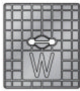
Lid Type A