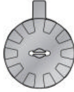
Lid Type H