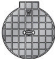
Lid Type G