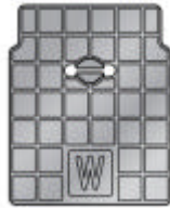
Lid Type B