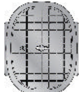
Lid Type M