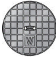
Lid Type C