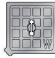
Lid Type D