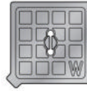
Lid Type D