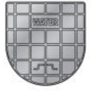
Lid Type F