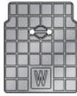
Lid Type B