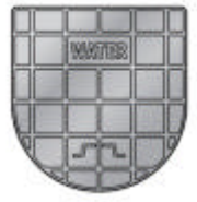
Lid Type F