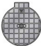
Lid Type G