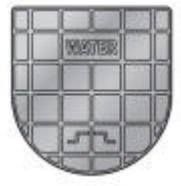
Lid Type F