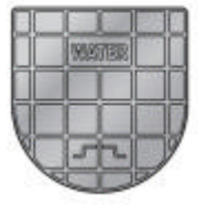
Lid Type F