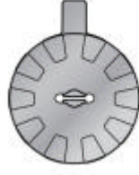
Lid Type H