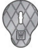
Lid Type J