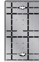
Lid Type L