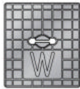
Lid Type A