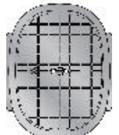
Lid Type M