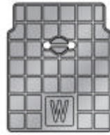
Lid Type B