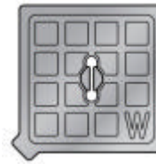
Lid Type D