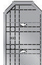
Lid Type K