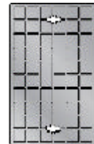
Lid Type L