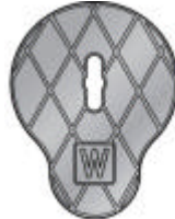
Lid Type J