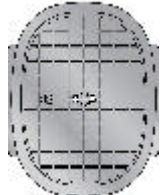
Lid Type M