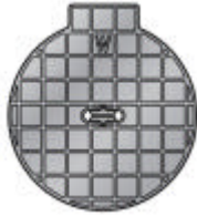
Lid Type G