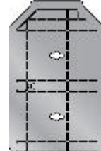
Lid Type K