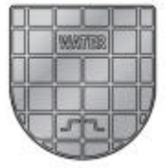
Lid Type F